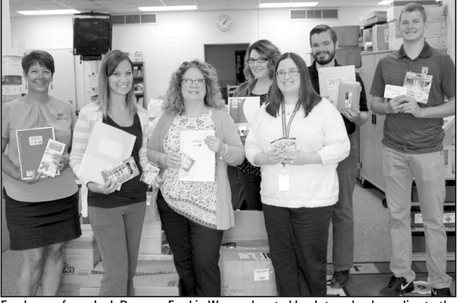
Employees from Jack Demmer Ford in Wayne donated back-to-school supplies to the Family Resource Center.

Jack Demmer Ford employees have supported the FRC for many years too. They delivered a variety of