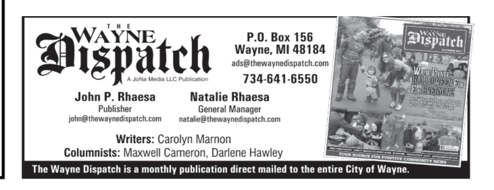
4 · October 2017· The Wayne Dispatch