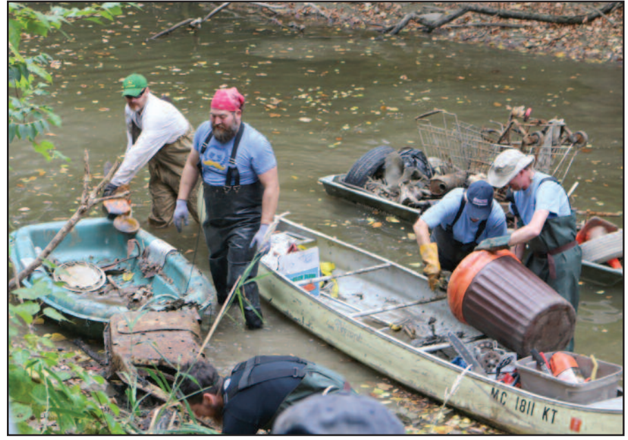
Twenty Detroit Zoo employees and Rouge Rescue Volunteers removed boatloads of tires, shopping carts, broken glass, metal including several sewer lids and other trash from the river between Clark Street and Goudy Park.

"The hard working volunteers from the Detroit Zoo are a perfect example of how organizations can make a difference in the Rouge River watershed. By partnering their em-