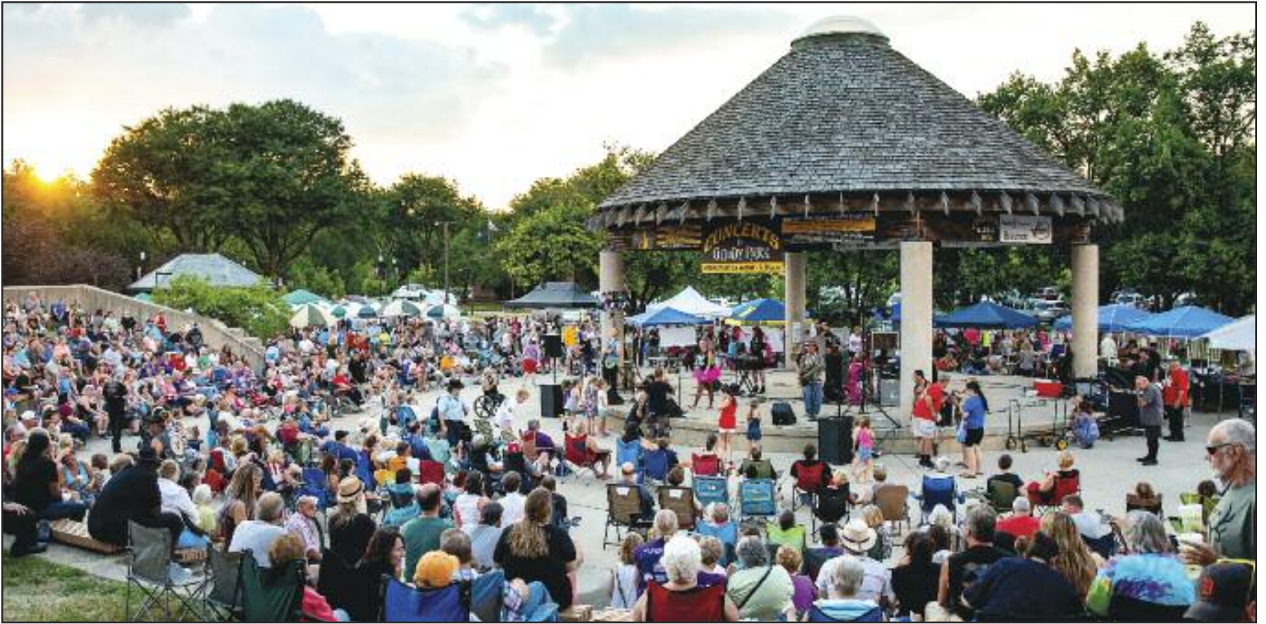
Square Pegz rocked at Goudy Park in July.