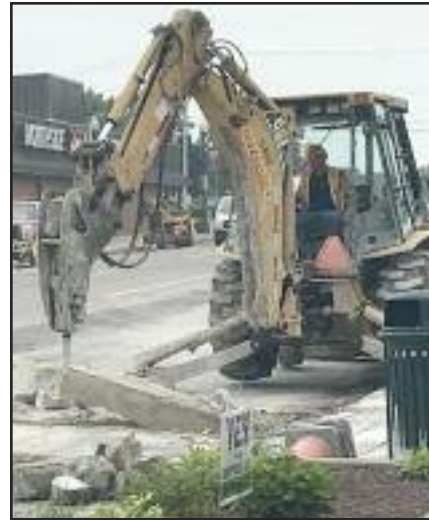
Construction of Wayne Road is scheduled to be complete by November.

While Wayne Road is getting updated, questions have arisen as to whether crosswalks, bike lanes and other improvements could slow down traffic along Wayne Rd. Businesses have long lamented how fast cars speed along Wayne Rd. Residents were more aware of the so-called deficiencies of the area during Downtown Days when the only places to legally cross the road were at the light at Glenwood and the light at Sims. Any event happening between those areas made it harder for