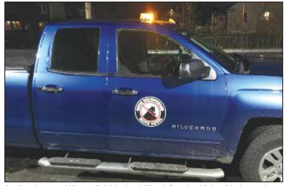
A privately-owned Wayne Neighborhood Watch Patrol vehicle with the newly approved amber light on top and WNWP identification magnet on the door.

met with the group and approved their use of the amber lights under the amended Michigan Complied Laws (MCL) which now allows their use. "I believe that the lights will give the group more visibility and make