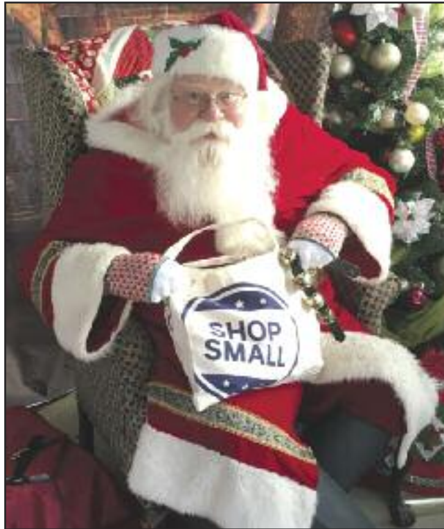
Kids under the age of 12 will have a chance to visit with Santa, including a free photo, from Noon to 2:00 p.m. at the State Wayne Theater during SBS.

Following the kick-off event, participants are