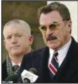
Blue Bloods stars, Greg Jbara and Tom Selleck.

cal, for which he won a Tony Award for Best Featured Actor in 2009. He heard about a hot new cop drama coming to New York starring Tom Selleck. Greg auditioned for three different characters without Tom in the room. He says he thought the magic was gone. At the end of the first season of Blue Bloods, Greg's agent called him to say Tom wanted him for a recurring role. "I'm hearing choirs of angels, and I'm thinking 'He still loves me.'" He is grateful for the opportunity to ride the coattails of the international star power of Tom Selleck.