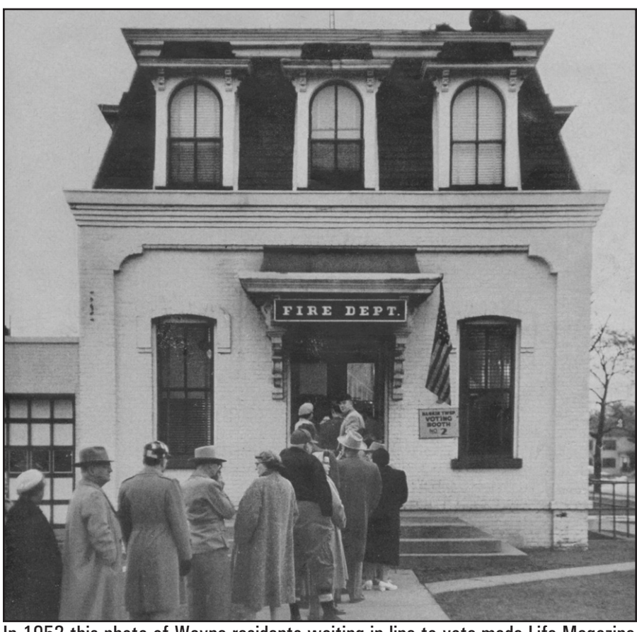
In 1952 this photo of Wayne residents waiting in line to vote made Life Magazine.

Today we are preparing for another election. Tuesday, November 8, 2011 is the date. You may wonder why Tuesday and why the Tuesday after the first Monday in November was selected. We can look back at history to find the reasons. In 1845 Congress debated the day to set for elections. Our country was an agrarian society. The voters (wealthy, white, men) had to travel two to three days to get to the polls and back to their farms. It could not overlap with various religions so Friday, Saturday and Sunday were out. Wednesday was market day so that left Tuesday as the best day. As for the month, elections could not interfere with the harvest and winter was a dangerous time to travel by horse and wagon so November was a likely Elections are an important part | pick. Today we still get out and vote