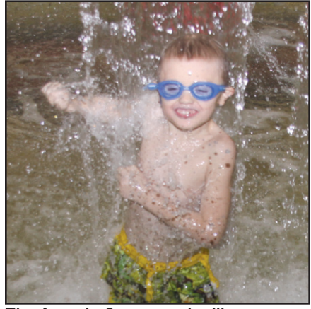
The Aquatic Center pool will re-open on Feb. 12.

"The Aquatic Area acts as the "Driver" of the Community Center as it has steadily increased its participa-