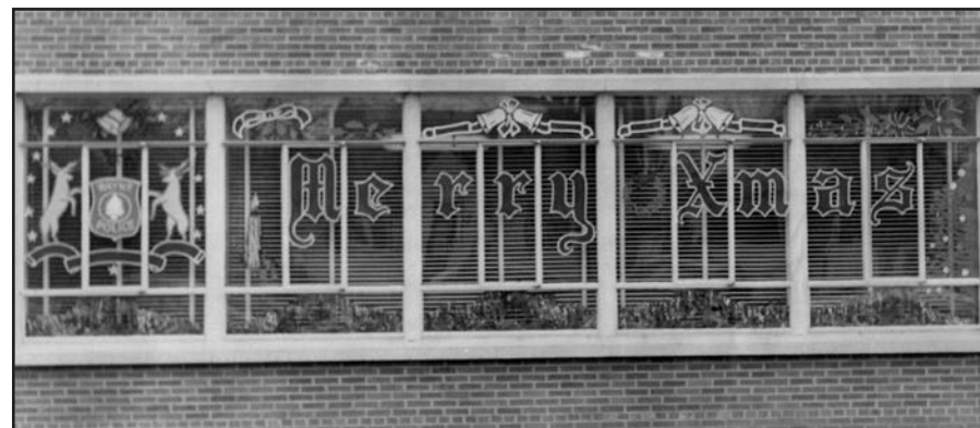
Former Police Chief Ed Yester painted Christmas pictures and messages on the windows of our old police station on Sims Street.

All of these traditions and customs from all over the world have been woven into the celebration of the holidays of the people in our community. There are some special