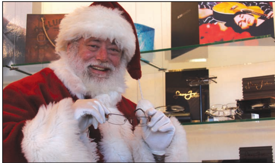
Santa knows where to go when he needs new glasses to read the naughty and nice list- In Focus Eyecare.

Looking for an idea that fits all budgets and tastes? How about a gift card to the State Wayne Phoenix Theatres? Whether it's used for date night or a family day out, the gift cards are good for admissions and concessions. They are available from $5 to $100 and the gift cards are reloadable so it's a gift you can give again and again!