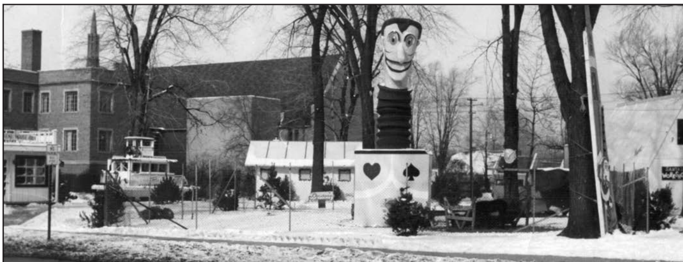
Wayne families spent many years enjoying the Santa Land festivities in town.