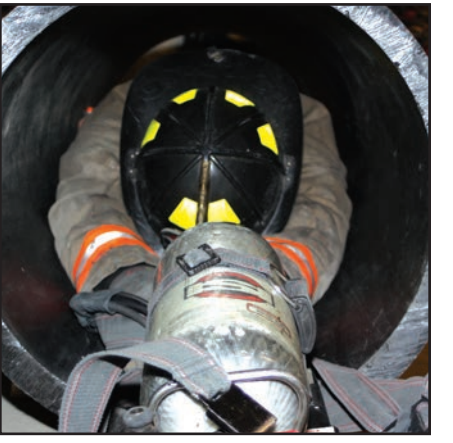
Firefighters practice going through the obstacle course blind.

Then there is a tunnel with a 90degree turn, a collapsed ceiling with hanging wires, exiting through a sec-