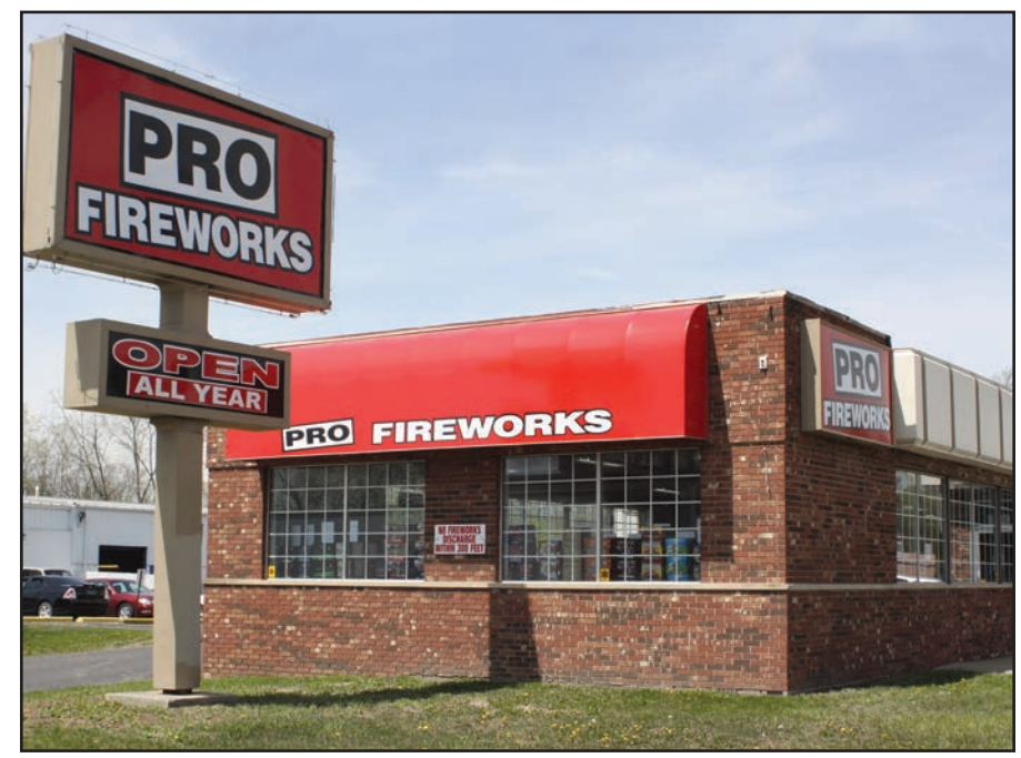
Pro Fireworks is now open year round at 38910 Michigan Avenue on west bound Michigan Avenue across from the Michigan Assembly Plant.

Pro Fireworks operates four other stores in Michigan, two in the Grand Rapids area, one in Traverse City and one in Sterling Heights.