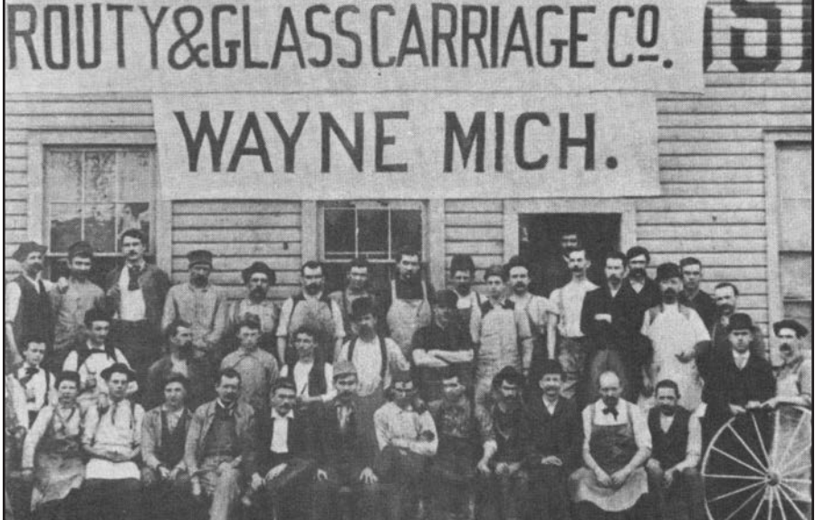
Prouty & Glass employees, about 1900.

Many other industries followed the Prouty and Glass Company in making their home in Wayne. Some were large and some were small.