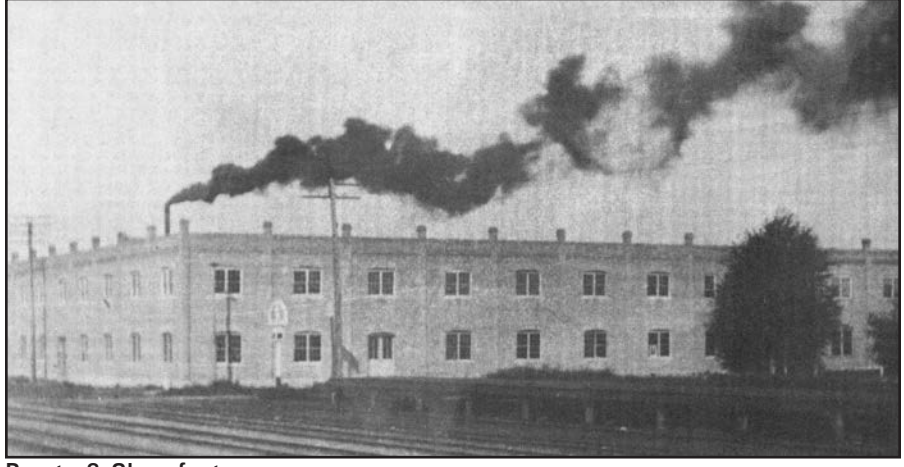
Prouty & Glass factory.

Some were here a short time and some for many years. To mention a few, there was the Harroun Car Company, the Enot Foundry, the Wire Cloth Company, Minnesota Mining and Manufacturing and Garwood Industries. Two of the largest that have made their home in Wayne for years and continue to operate today are