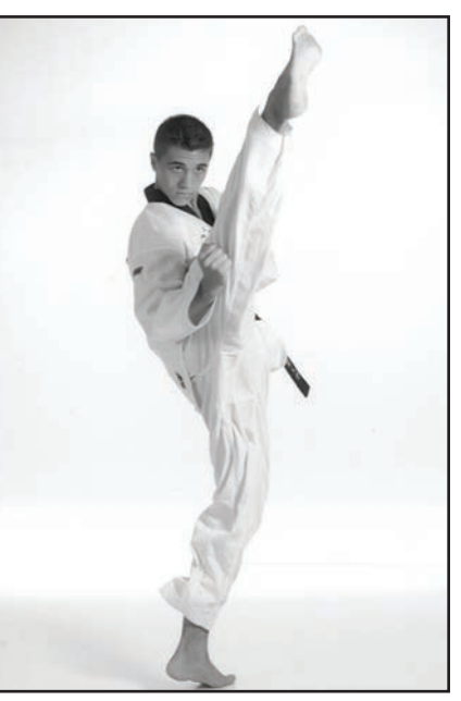
Eric Rose Memorial Championship is on May 18.