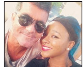
Simon Cowell Judge on X-Factor

"I was really impressed. We could make you incredible because you have the talent. You really do."