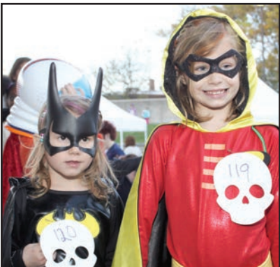
Batgirl and Robin.