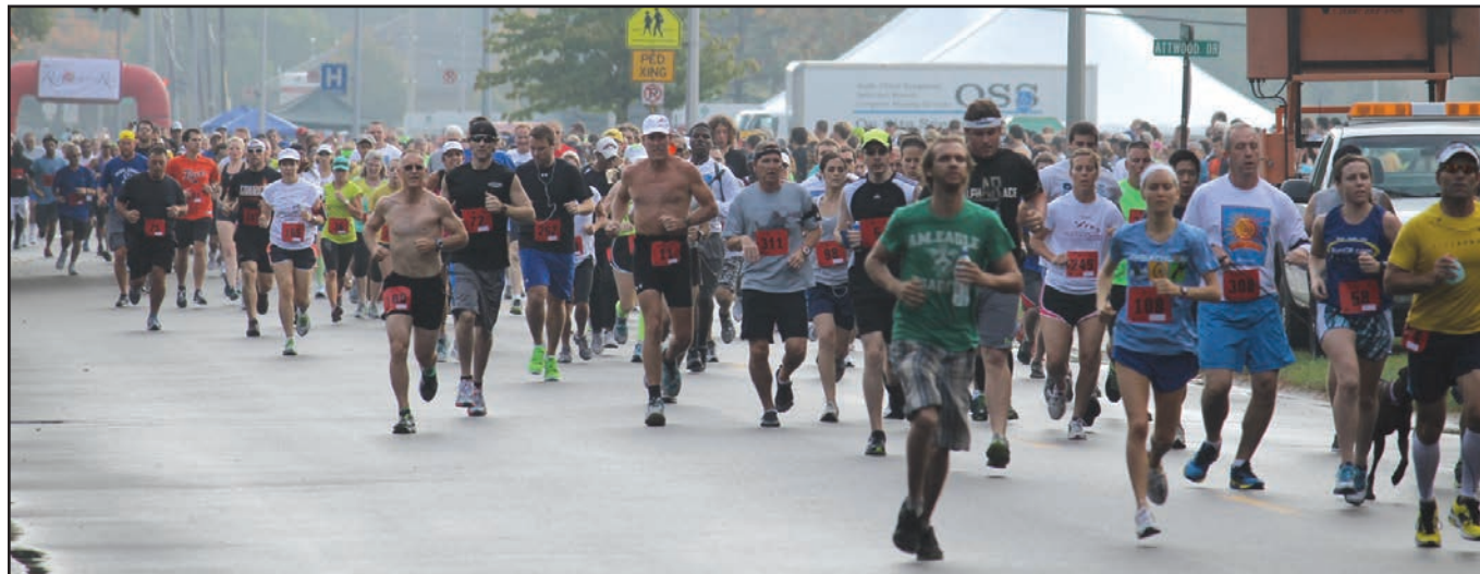
1,333 runners and walkers of all ages participated in the Red October Run this year.