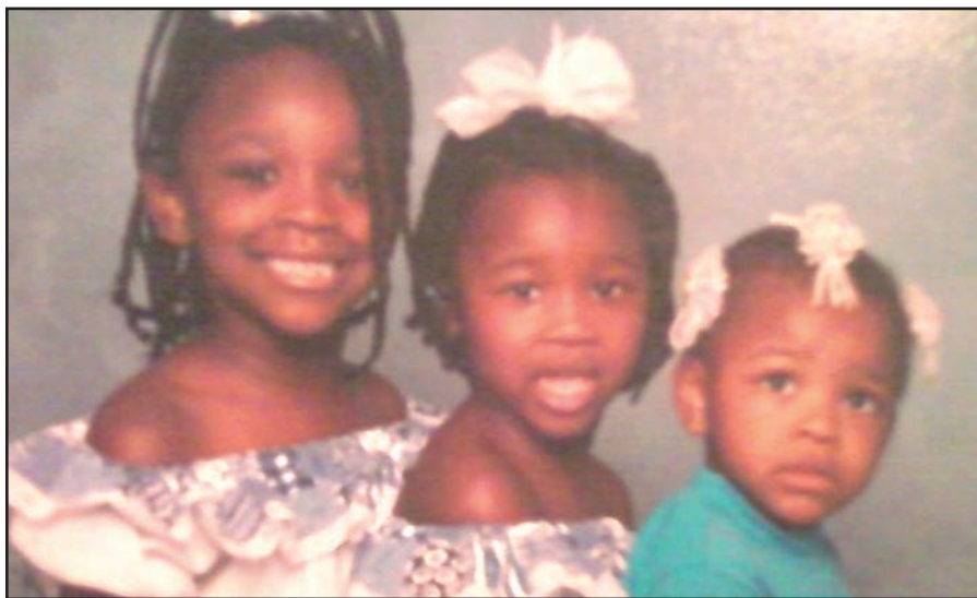
The Moton sisters