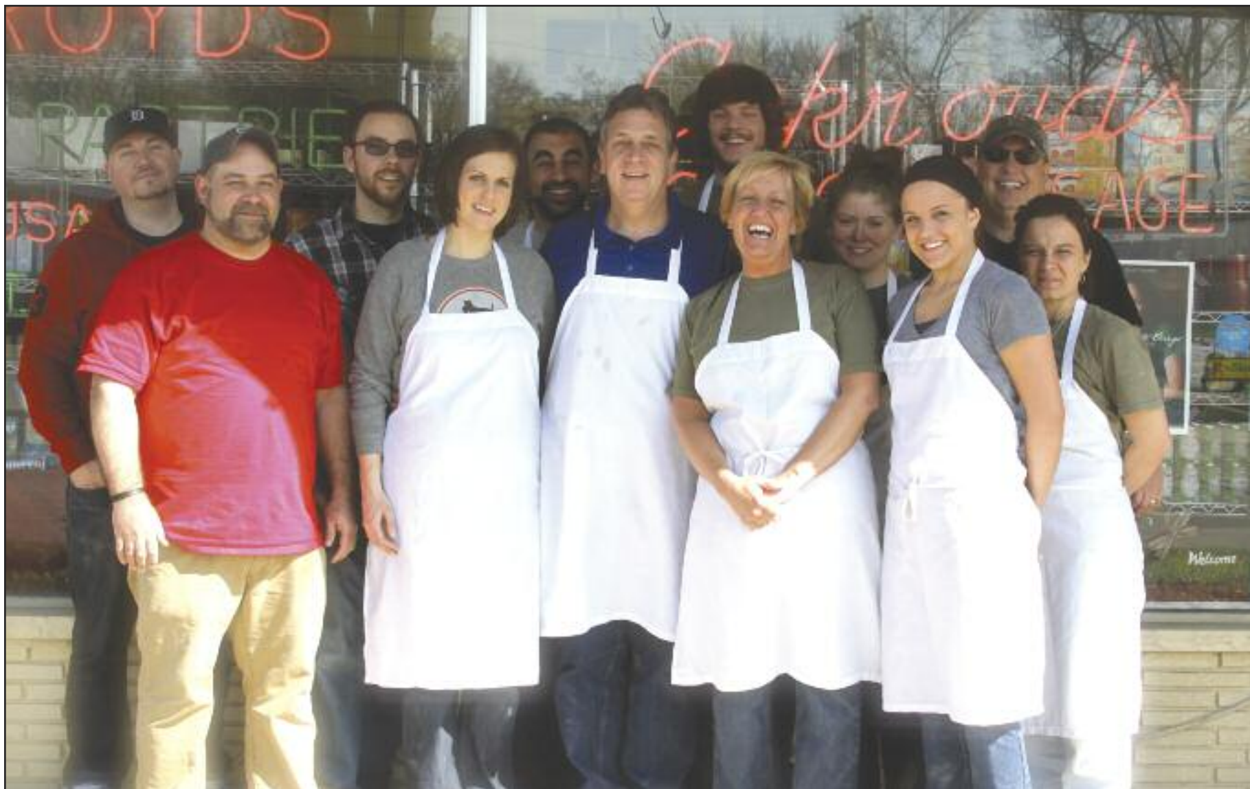
The Emmy award winning crew and staff of Ackroyd's Bakery.