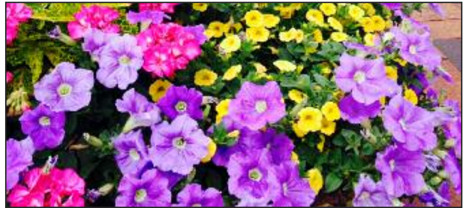
The adopt a planter program in downtown this year is in full bloom.

Wayne Ripple Effect's Promotions Committee is establishing a regular presence at the Wayne Farmer's Market every week. Thanks to the generosity of both the Wayne Chamber of Commerce and Growing Hope, we are able to set up a tent and table