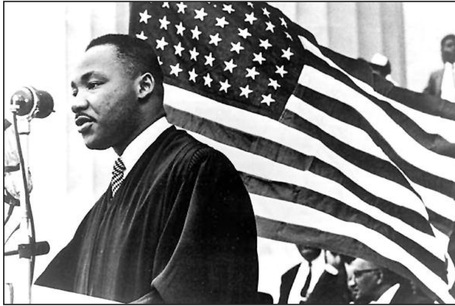
The Wayne-Westland Martin Luther King, Jr. Day Ceremony at 10 a.m. on Jan. 19 at Westland City Hall Grande Ballroom, 36300 Warren Rd.