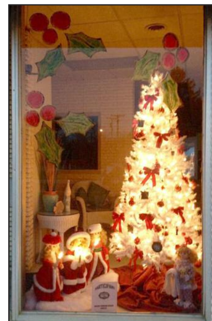
"Judge's Choice" award winner: JJ's Styling Station, 3131 S. Wayne Road.

The Wayne Main Street Design Committee will host an informational meeting announcing the new Wayne Main Street Façade Incentive Grant program! This informational meeting is intended for building and business owners located within the Wayne Main Street district and will present the Main Street 4-Point Ap-