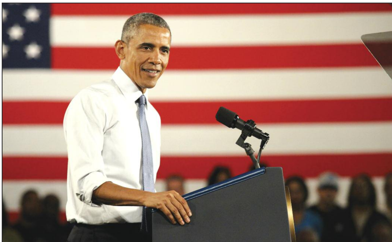
President Barack Obama believes the American auto industry is coming back.

"It was not popular to make the decision to bail out the auto industry," Obama said. Even in Michigan there was only about a 10% approval rating.