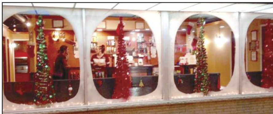
Platinum Tanning, 35501 W. Michigan Ave., was awarded the "People's Choice" in the Main Street Holiday lights contest.

Wayne Main Street is your organization. As a non-profit, volunteer driven organization your financial gift is needed to carry out the numerous projects that will revitalize Downtown Wayne in 2015. All donations are tax deductible! Visit www.downtownwayne.org and click "DONATE" for more information.