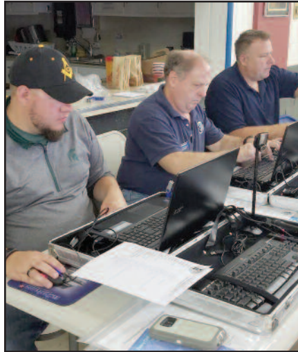
Michigan Masons working with The Michigan Child ID Program that provides parents a "Child ID Kit".

In the past, information collected was downloaded to a CD. An EZ Child ID mobile app is now available which saves the information to a parent's phone. The parent also gets a