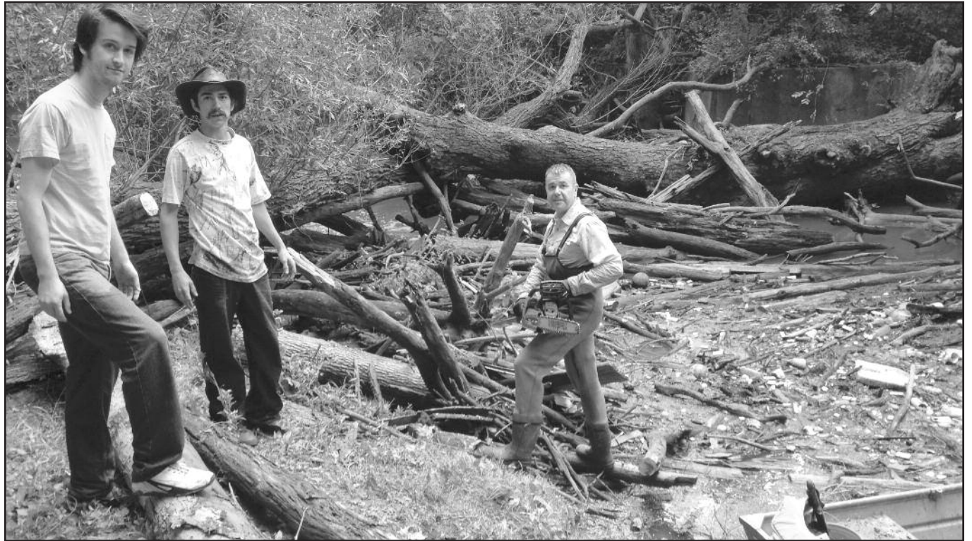
Volunteers work to remove debris from the Rouge River.

Local volunteers also went to work to clean out all of the trash that fouled the Rouge and was a local eyesore. Over the last couple decades, a small army of volunteers has pulled out of the river a virtual mountain of tires, shopping carts, car parts, bathtubs, stoves, barbecue grills, lawn mowers... and just about anything else you can imagine. Even a pop machine. Working in conjunction with City of Wayne officials, the volunteers have really improved the aesthetic of the river, and helped change atti-