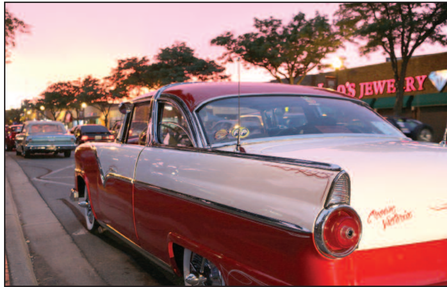
Come to Downtown Wayne for Crusin' US12 on July 15th.