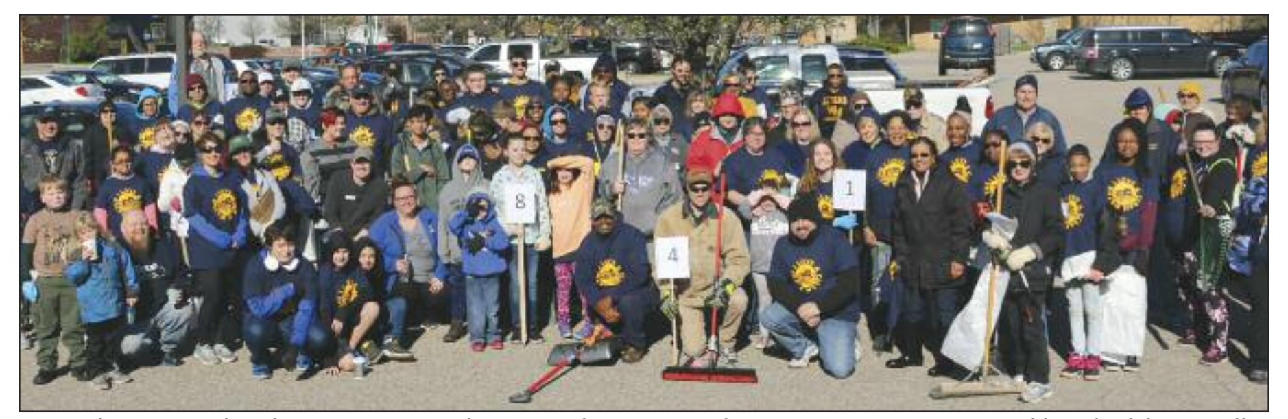
Wayne Main Street hosted it's Third Annual Downtown Spring Clean Up. Pictured are some of the more than 150 volunteers who participated in this important effort.