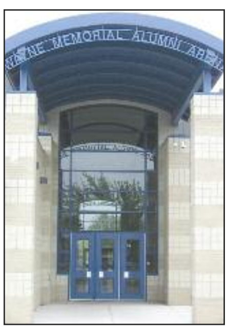
Wayne Memorial Alumni Arena

The new Hall of Fame will be housed in the Alumni Arena on the Wayne Memorial High School campus and will be comprised of individuals that have been identified as having a direct connection to Wayne Memorial High School. The list below are members of the Wayne Westland Athletic Hall of Fame the committee felt met criteria for inclusion in the Wayne Memorial High School Athletic Hall of Fame.