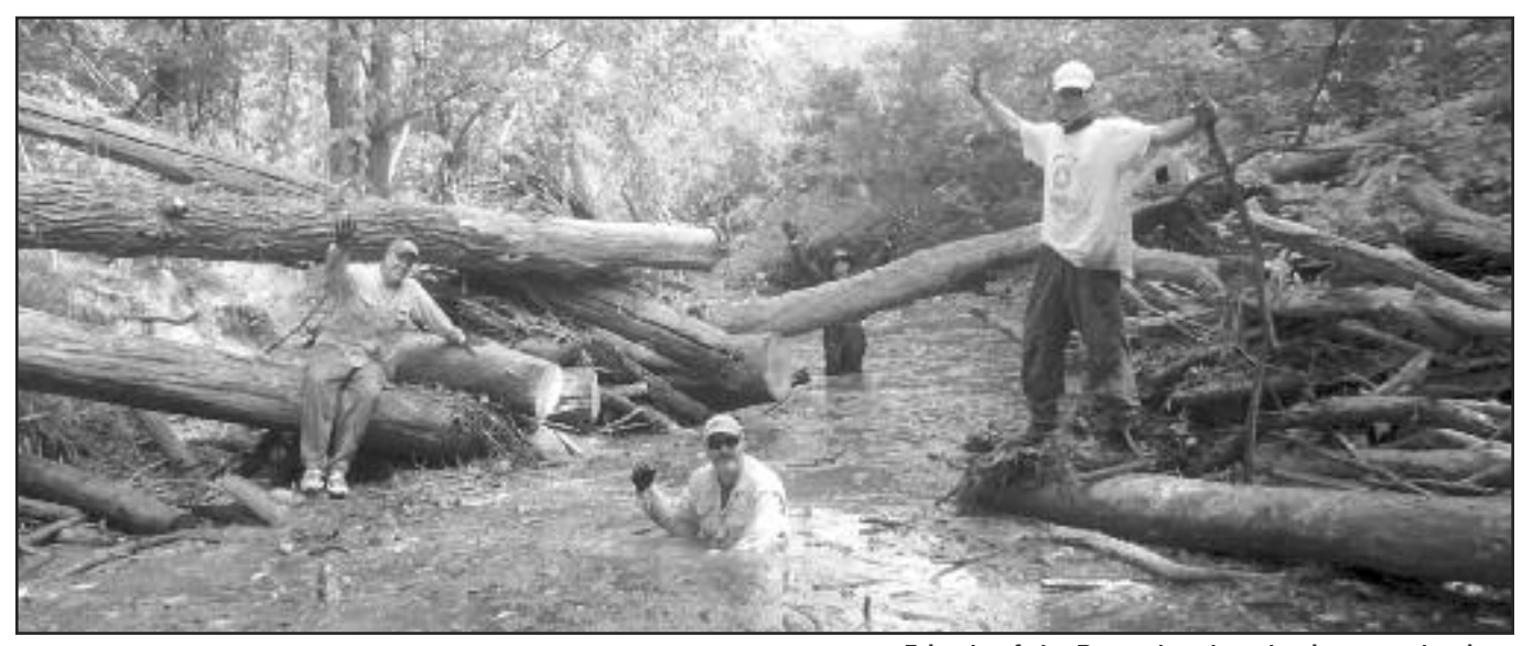
Friends of the Rouge break up log jams on the river.

Friends of the Rouge, the lead organization in the water trail effort, recently hosted an open house about the LRWT at the Jefferson Barns Community Vitality Center, where they unveiled preliminary strategic plan. The meeting was well attended by many stakeholders, who provided input about what they would like the LRWT look like. Many Wayne residents attended the meeting.