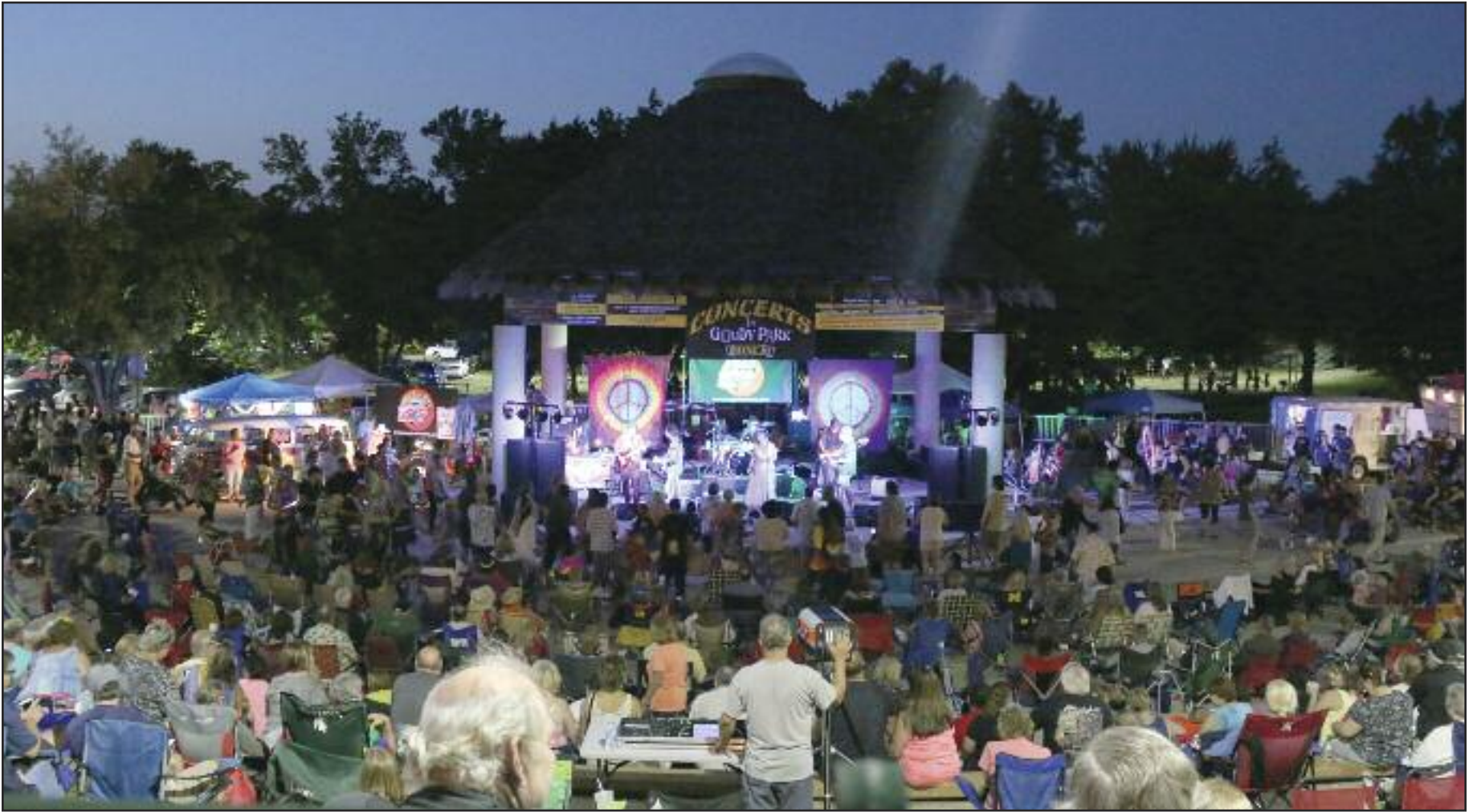
The Wayne Rotary Concerts in Goudy Park are Wednesday nights in Downtown Wayne starting July 17th.