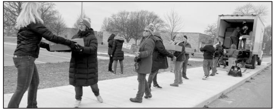
Wayne-Westland Community Schools drive-thru food distributions passed out over 2,200 breakfasts and 2,200 lunches to children at John Glenn High School.

Meal pick up time has been 10:00 a.m. through 1:00 p.m. at John Glenn High School, 36105 Marquette, Westland. This has been a drive-thru distribution. Students do not need to be present for fami-