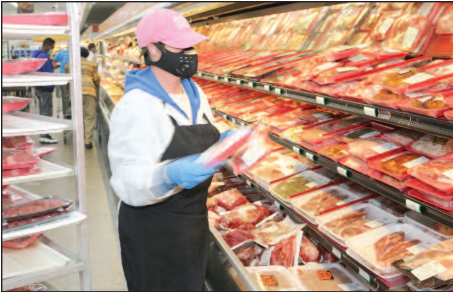
Fresh Choice grocery store butcher stocks the shelves daily with fresh meat.