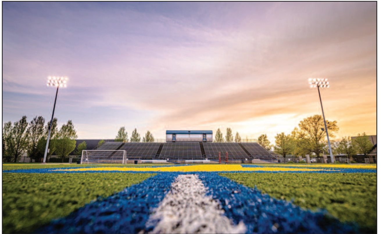
WMHS Zebra Stadium is lit up at 20:20 (8:20 p.m.) to remind the Class of 2020 to Be the Light.