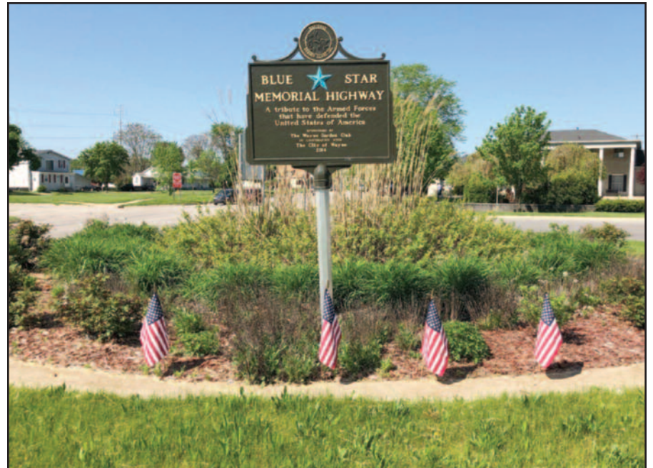
The Blue Star Memorial Garden is in front of Harry J Will Funeral Home between the two Michigan Avenues.