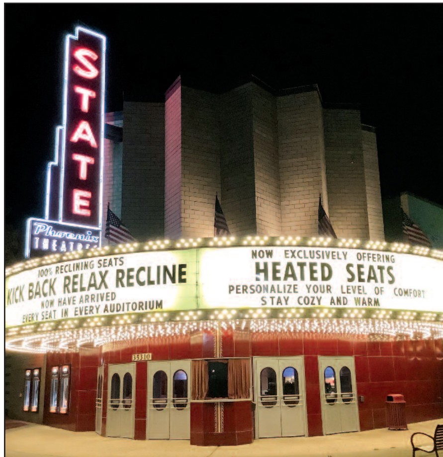
The State Wayne is Phoenix Theatre's company jewel.

Phoenix Theatres was founded in Southeast Michigan 20 years ago, and 2 years ago opened a location in Dubuque, Iowa -- where on May 22nd Iowa Governor Kim Reynolds made the announcement that movie theatres could reopen with restrictions. Phoenix Theatres however, decided to wait and utilize this time instead to train local management and employees on their new protocols and make upgrades to their ticketing system that will allow the computer to automatically practice social distancing inside each auditorium by implementing reserved seating.