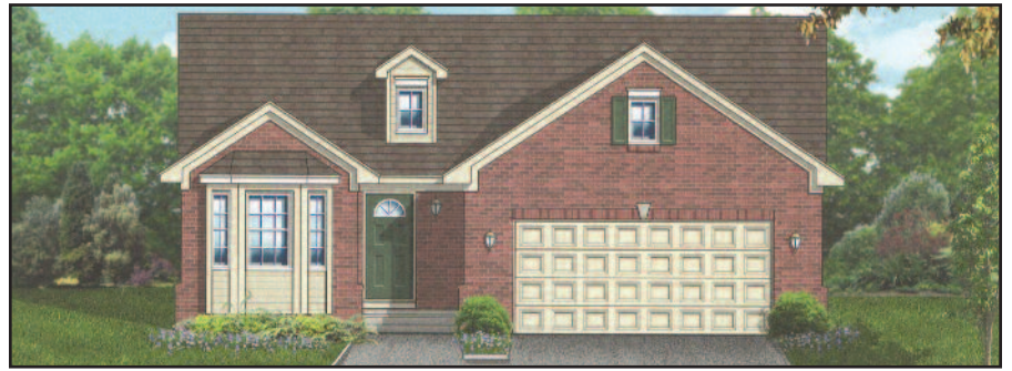
A sample of a current Infinity home called the Catalin.

The plan is for the City to trade Taft-Galloway Park to the district in return for the Vandenberg school site. This sales opportunity cannot move forward until the school board