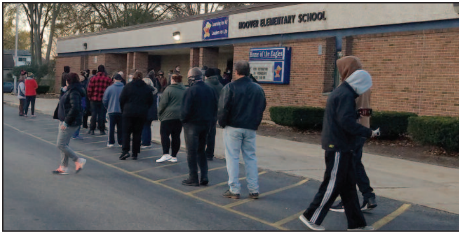
Voters were lined up out the doors to vote at Hoover Elementary School on election day.